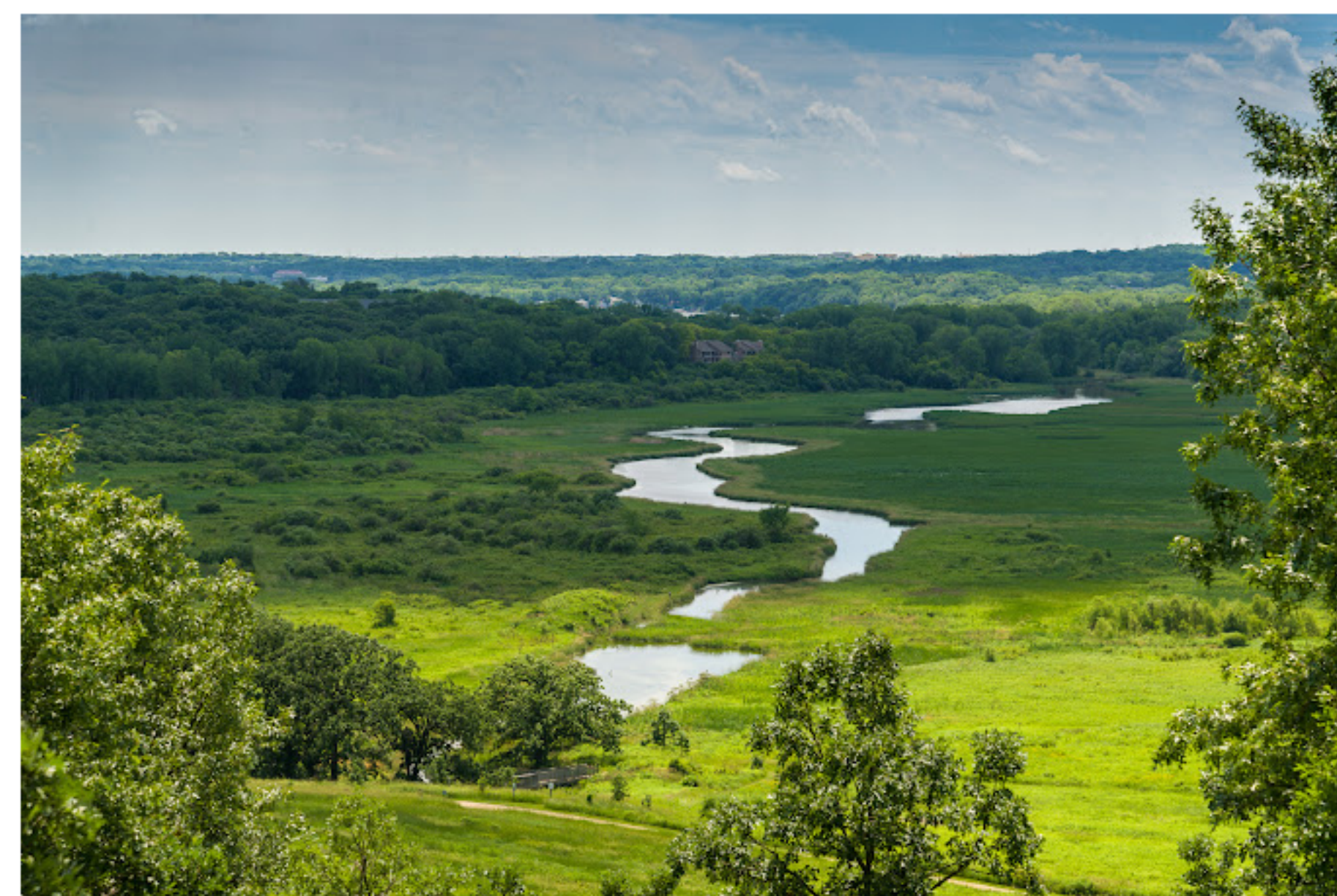
Pheasant Branch Conservancy